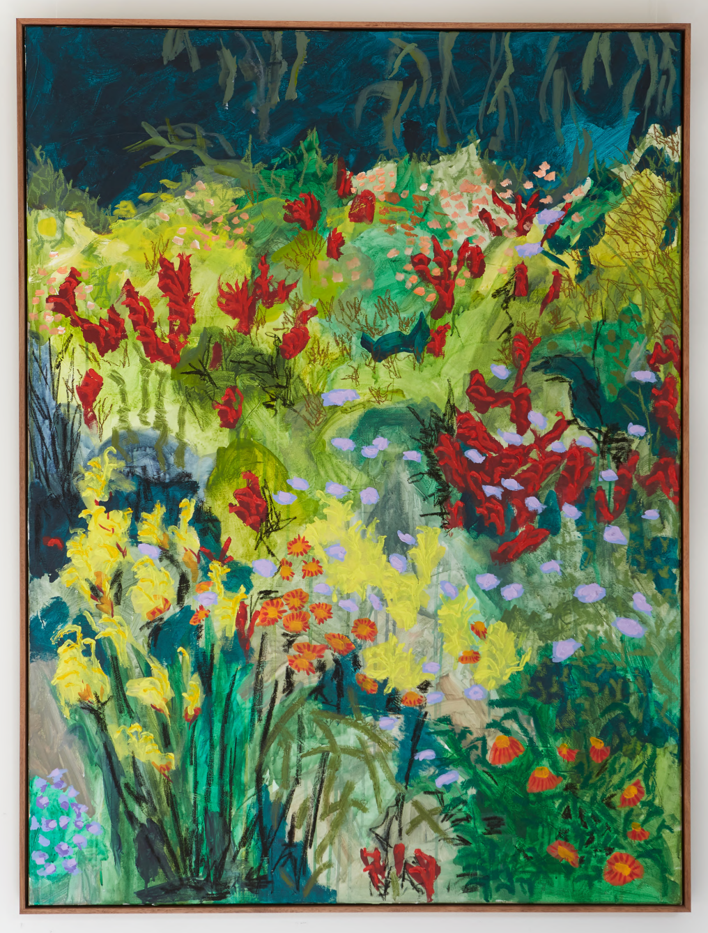
Gold Velvet, 2021 Acrylic, oil, oil stick and soft pastel on linen 92x122cm framed in Tasmanian Blackwood $4,100 (sold)