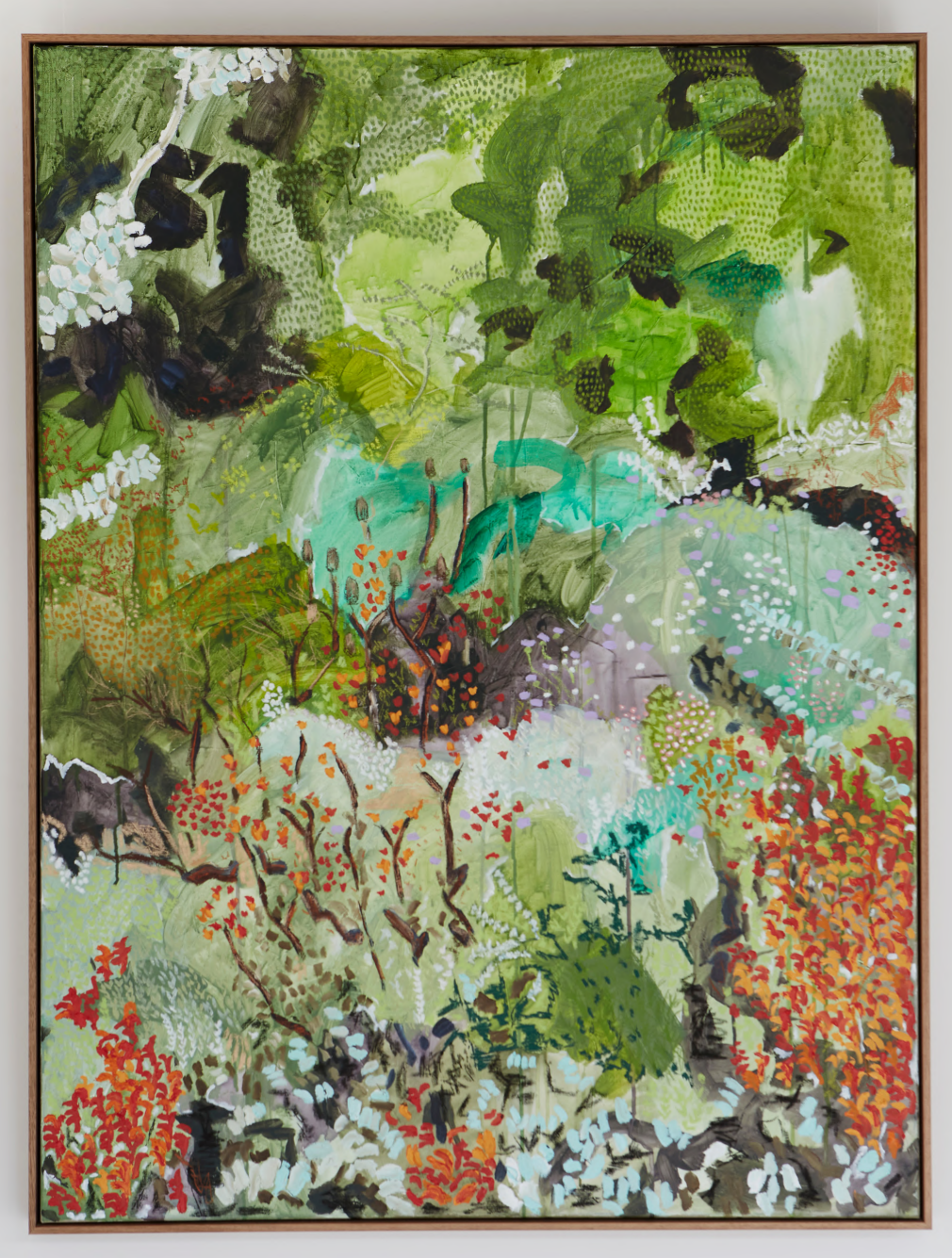
Rose Mallee, 2021 Acrylic, oil, oil stick and soft pastel on linen 92x122cm framed in Tasmanian Blackwood $4,100 (sold)