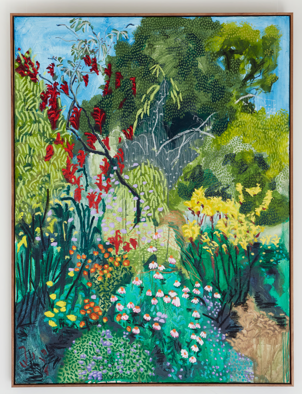
Ruby Velvet, 2021 Acrylic, oil, oil stick and soft pastel on linen 92x122cm framed in Tasmanian Blackwood $4,100 (sold)