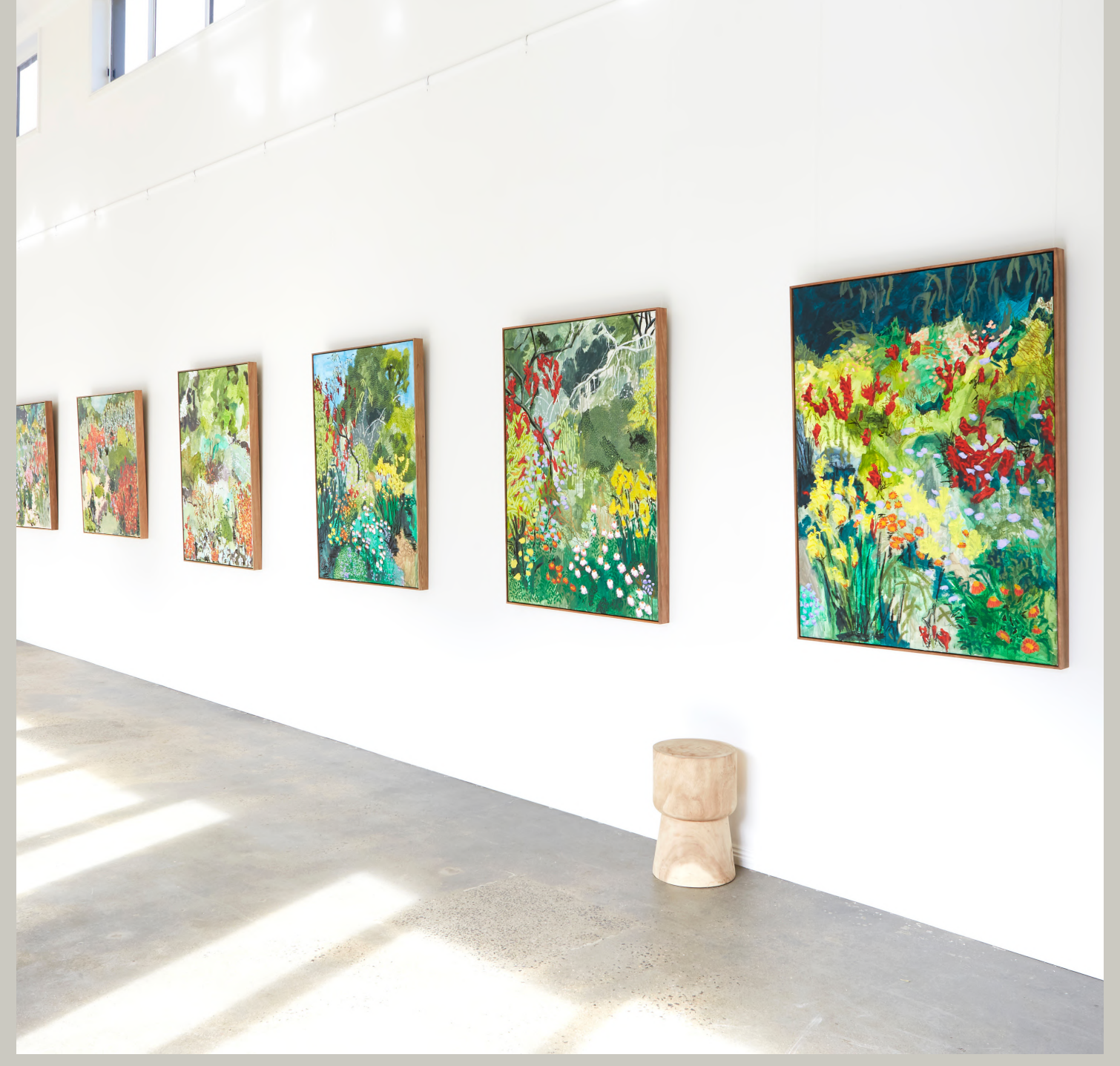
The Ko, Photography by Anita Beaney